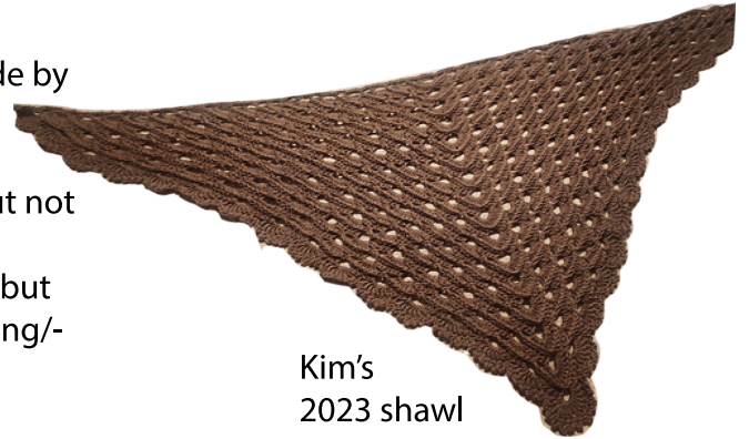
Kim's 2023 shawl

Yarn Type: No specific requirements, but please include a tag/note with washing/-care instructions.