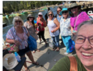
Knitting on the lake was fun for all involved

Our 3rd Saturday event in the mall continues to grow in participants and is a great way to beat the heat, relax and have fun with friends.